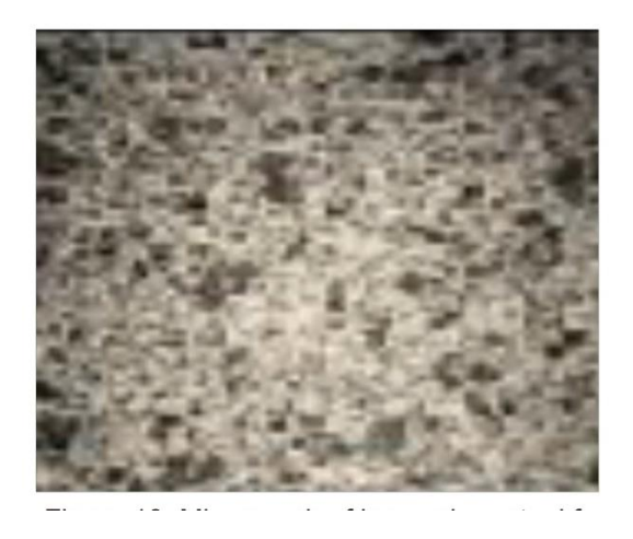
(e) 5 hours

Alagbe M.; Microstructural and Case Hardness Studies of Pack Cyanided Low Carbon Steel in Pulverized Cassava Leaves