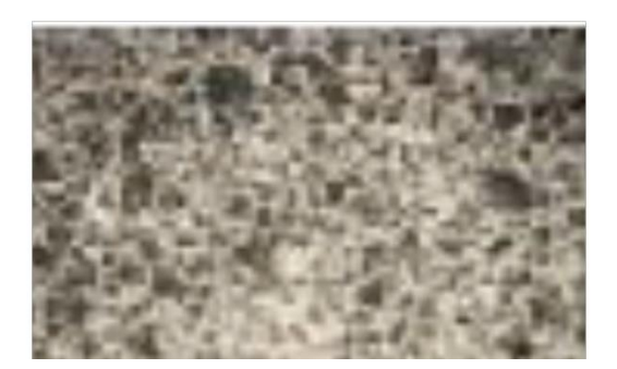
(e) 5 hours

Fig. 1: Micrographs of low carbon steel at different soaking times showing effect at pack cyaniding at 930^{0} C (x 100)