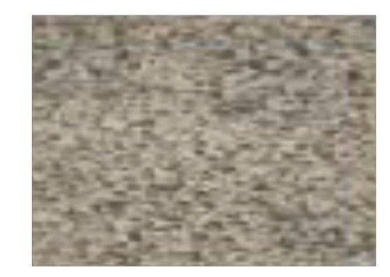
(d) 4 hours