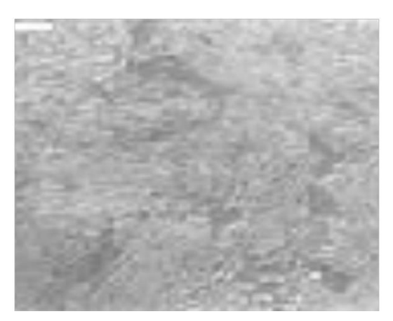
Fig. 3: Micrograph of as – received low carbon steel sample (x 100)

Fig. 2: Micrographs of low carbon steel at different soaking times showing effect at pack cyaniding at 570^{0} C (x 100)