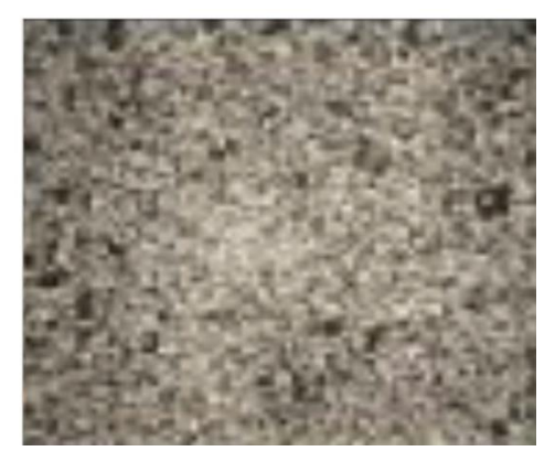
(d) 4 hours