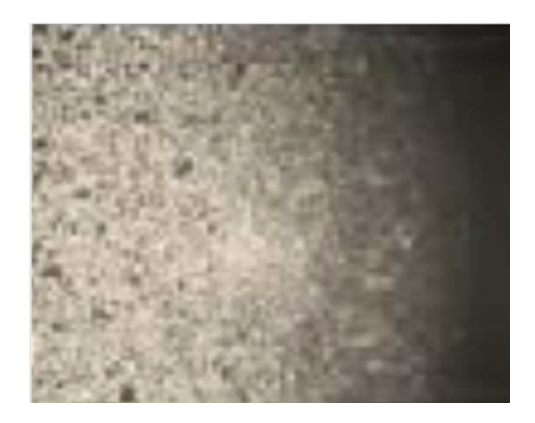
(b) 2 hours