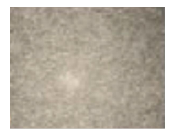
(a) 1 hour

Fig. 1: Micrographs of low carbon steel at different soaking times showing effect at pack cyaniding at 930^{0} C (x 100)